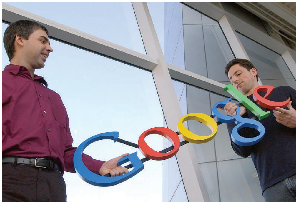
Sign of the times: Google co-founders Larry Page (left) and Sergey Brin have an icon on their hands.